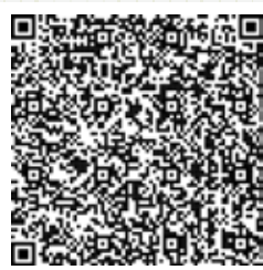
Google Map Location