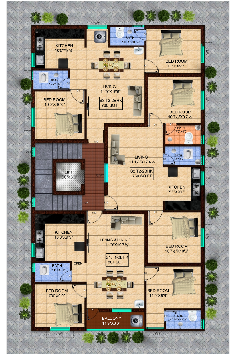
S1 & T1 - 2 BHK | 881 SQFT S2 & T2 - 2 BHK | 730 SQFT S3 & T3 - 2 BHK | 786 SQFT