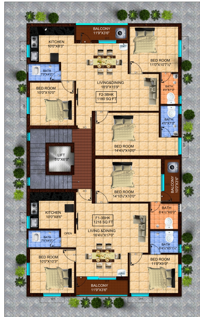
F1 - 3 BHK | 1218 SQFT F2 - 3 BHK | 1180 SQFT